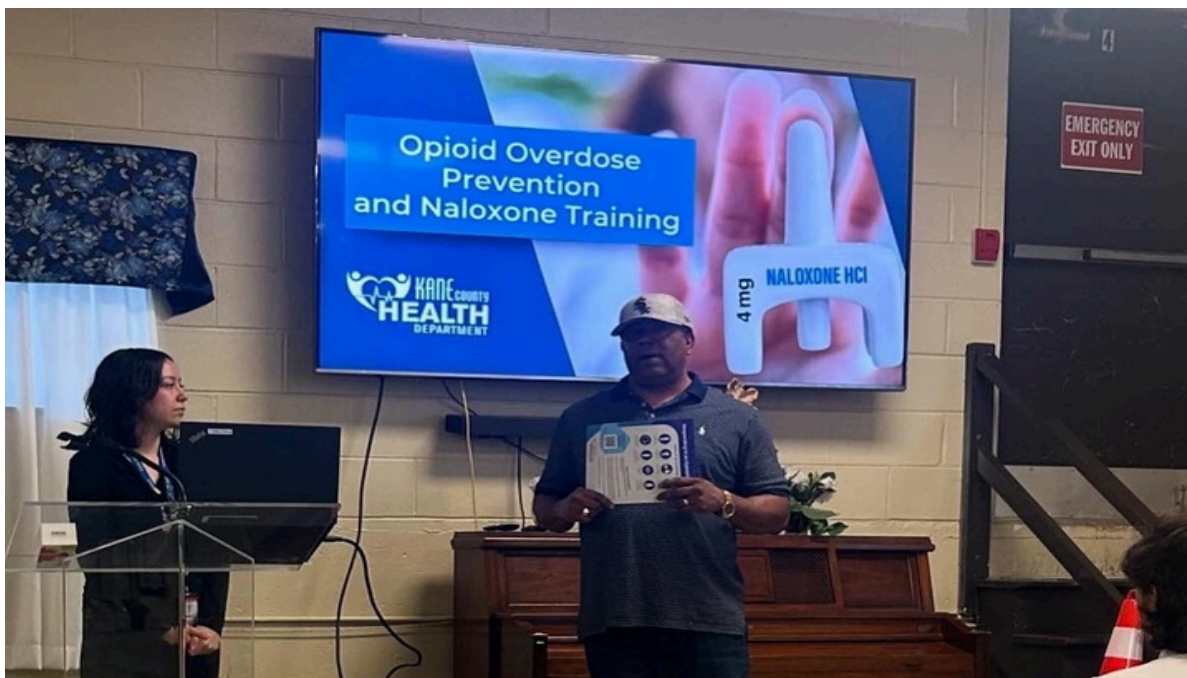
Kane County Health Department

The discussion emphasized compassion, safety, and community responsibility — equipping attendees with the knowledge and tools to save lives and support those in need. This important workshop reflects WeNxt's ongoing commitment to promoting education, wellness, and empowerment within our community.