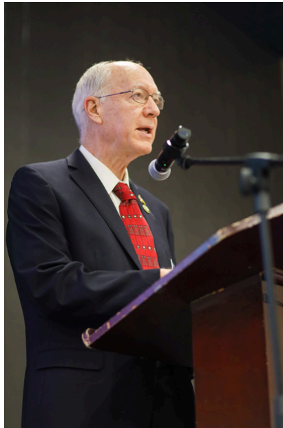
Congressman Bill Foster